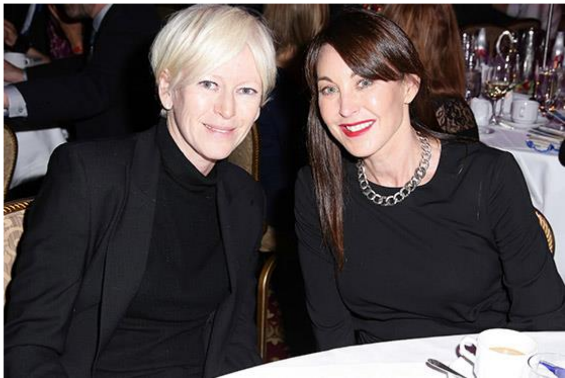
Joanna Coles and Tamara Mellon