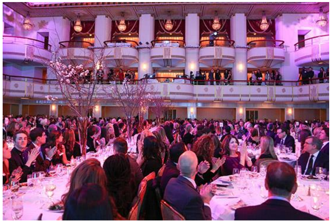
The scene at the Waldorf Astoria for YMA Fashion Scholarship Fund & Geoffrey Beene Foundation's annual benefit dinner