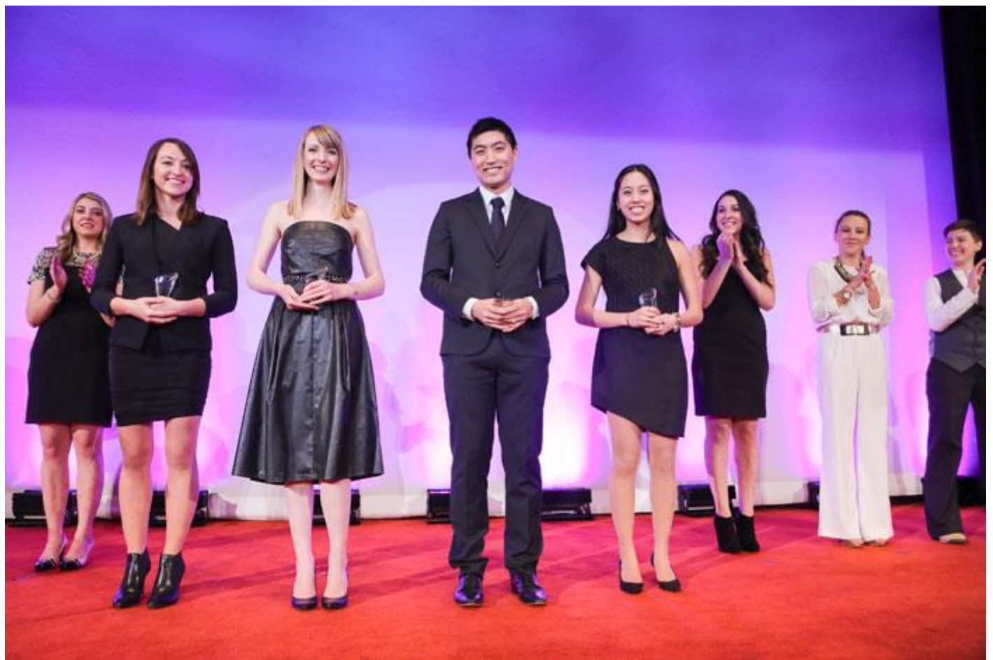
Geoffrey Beene National Scholarship winners.

On January 8, at the Waldorf Astoria, YMA Fashion Scholarship Fund & Geoffrey Beene Foundation's annual benefit dinner gathered more than 1,000 members of the fashion industry to honor industry leaders and recognize the 131 YMA FSF scholarship recipients and eight Geoffrey Beene National Scholar finalists. The event raised $1.85m and presented $820,000 in scholarship grants.